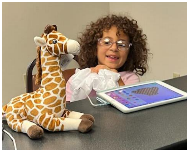
Big Sis Summer received a gift also!