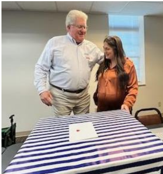
What's in the big blue & white box?