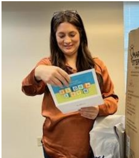
Gift Card from Door Dash

Celebrating Libertie's soon to be delivered baby boy at our October meeting: